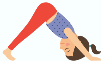
DOWN DOG POSE