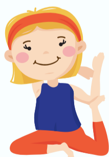
SEATED SIDE POSE