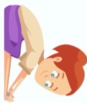
BIG TOE POSE