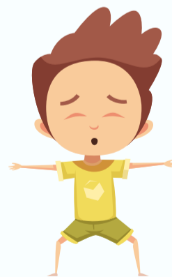
WARRIOR 2 POSE