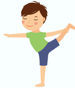
LORD OF THE DANCE POSE